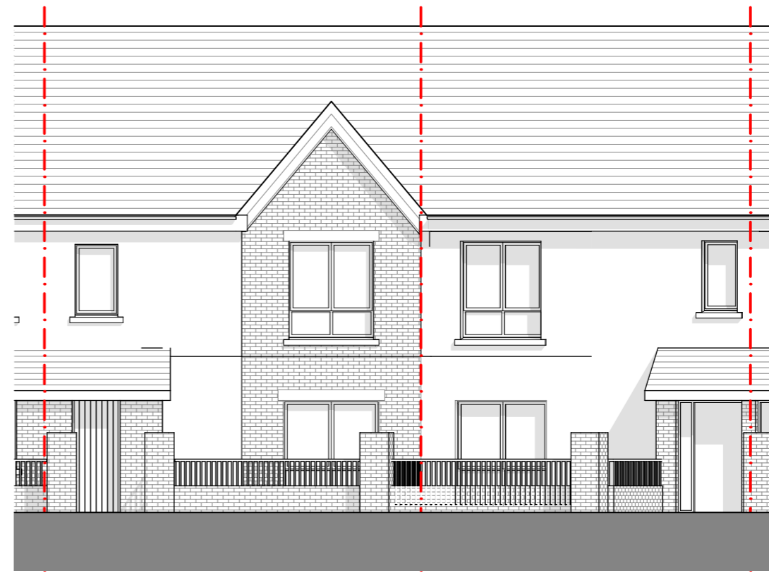
Front Elevation 1:100

NOTE: PLEASE NOTE BUILDING SECTION F1/F2/F3/F4 IS THE TYPICAL BUILDING SECTION FOR HOUSE TYPES F1, F2, F3 & F4. PLEASE REFER DWG NO 18205-PLA-077 FOR BUILDING SECTION